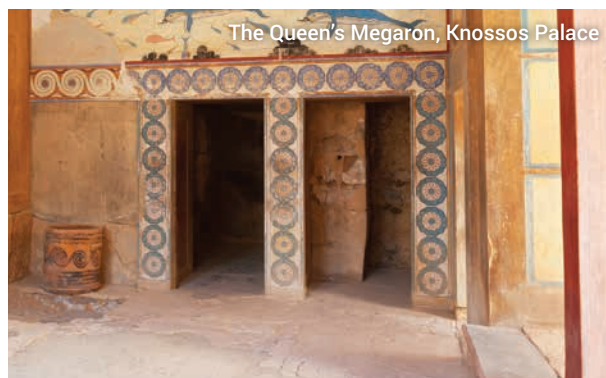
The Queen's Megaron, Knossos Palace

We end at the Archaeological Museum of Heraklion to find out more of the background to the history and culture of Crete.