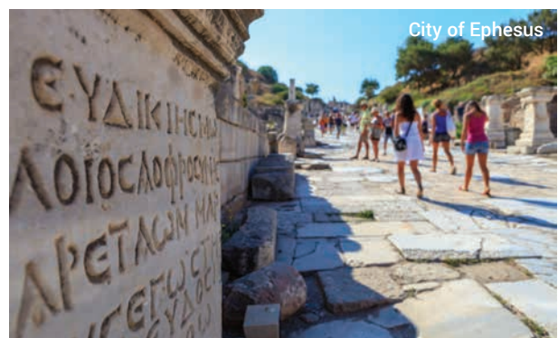
City of Ephesus

We have time for shopping for carpets, jewellery, leather and other souvenirs at the end of our tour.