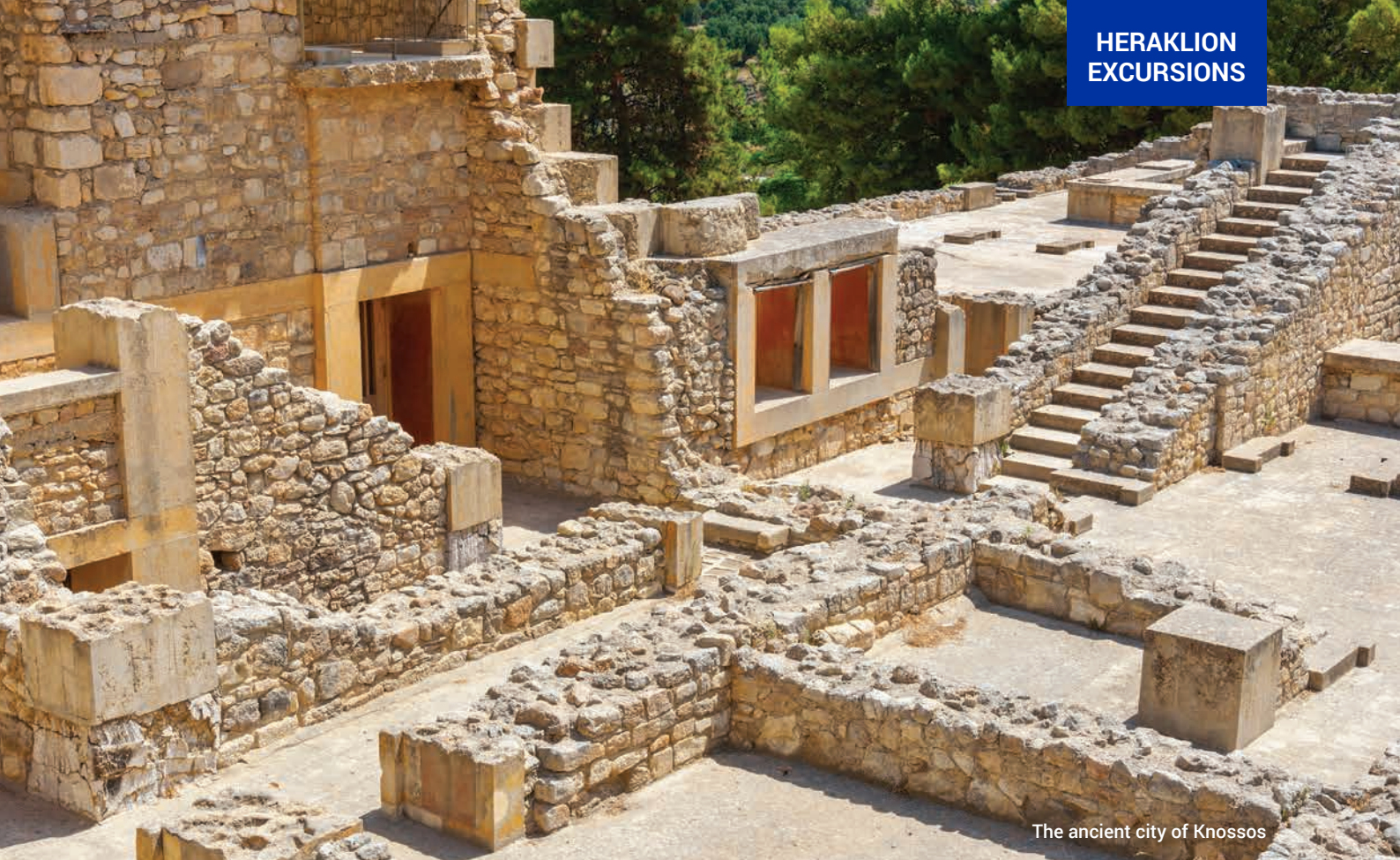
The ancient city of Knossos