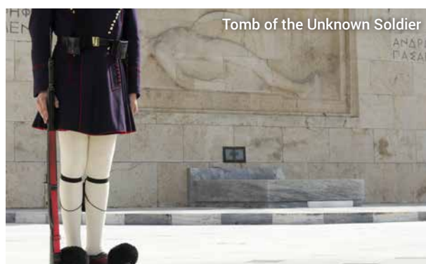
Tomb of the Unknown Soldier