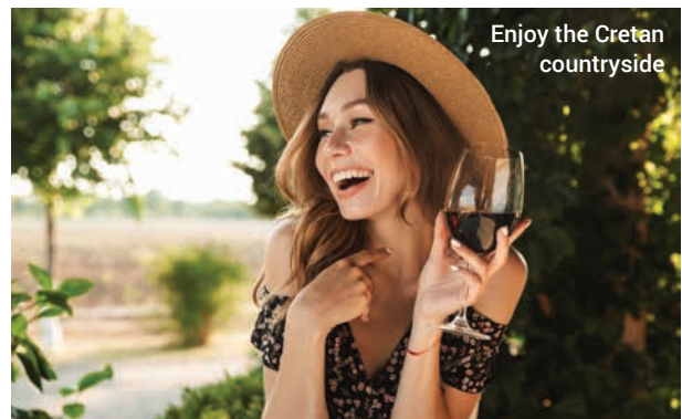
Enjoy the Cretan countryside

wonderful structures including the 'Koules' fortress, Venetian Loggia, Basilica of St Mark, medieval monastery of St Catherine and the Cathedral of Agios Minas.