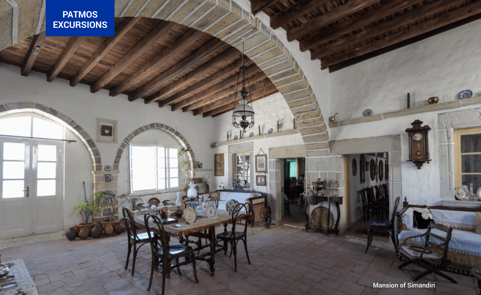
Mansion of Simandiri