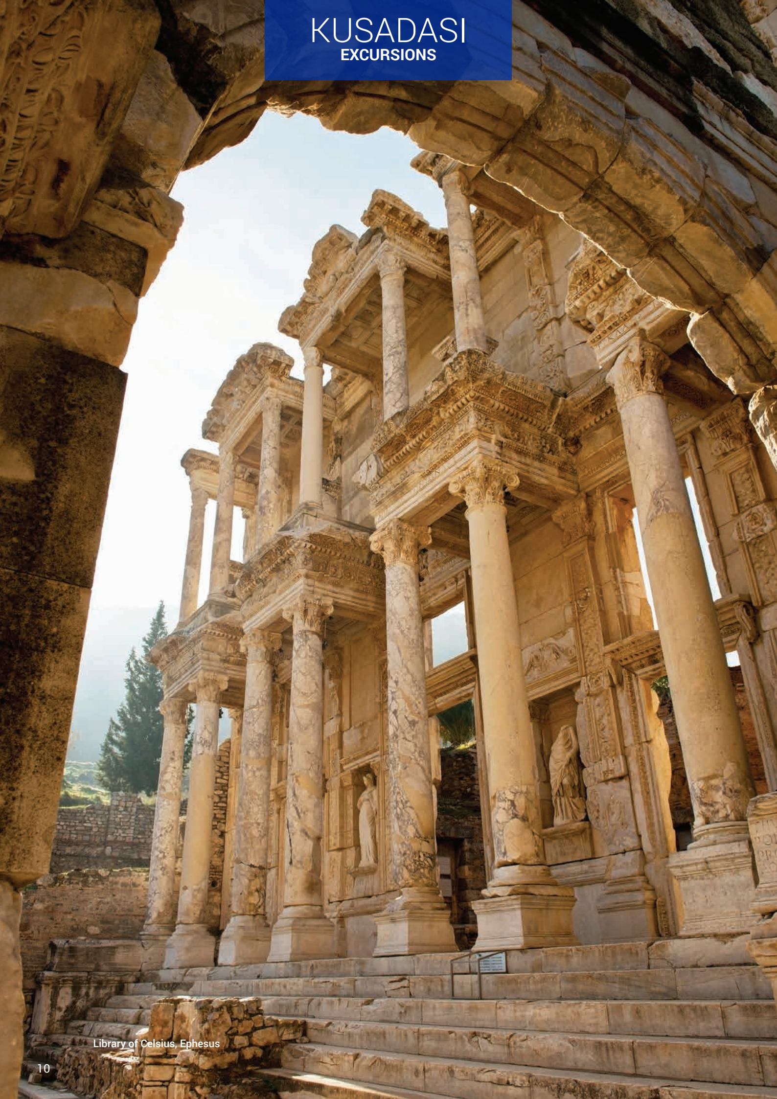
Library of Celsus, Ephesus