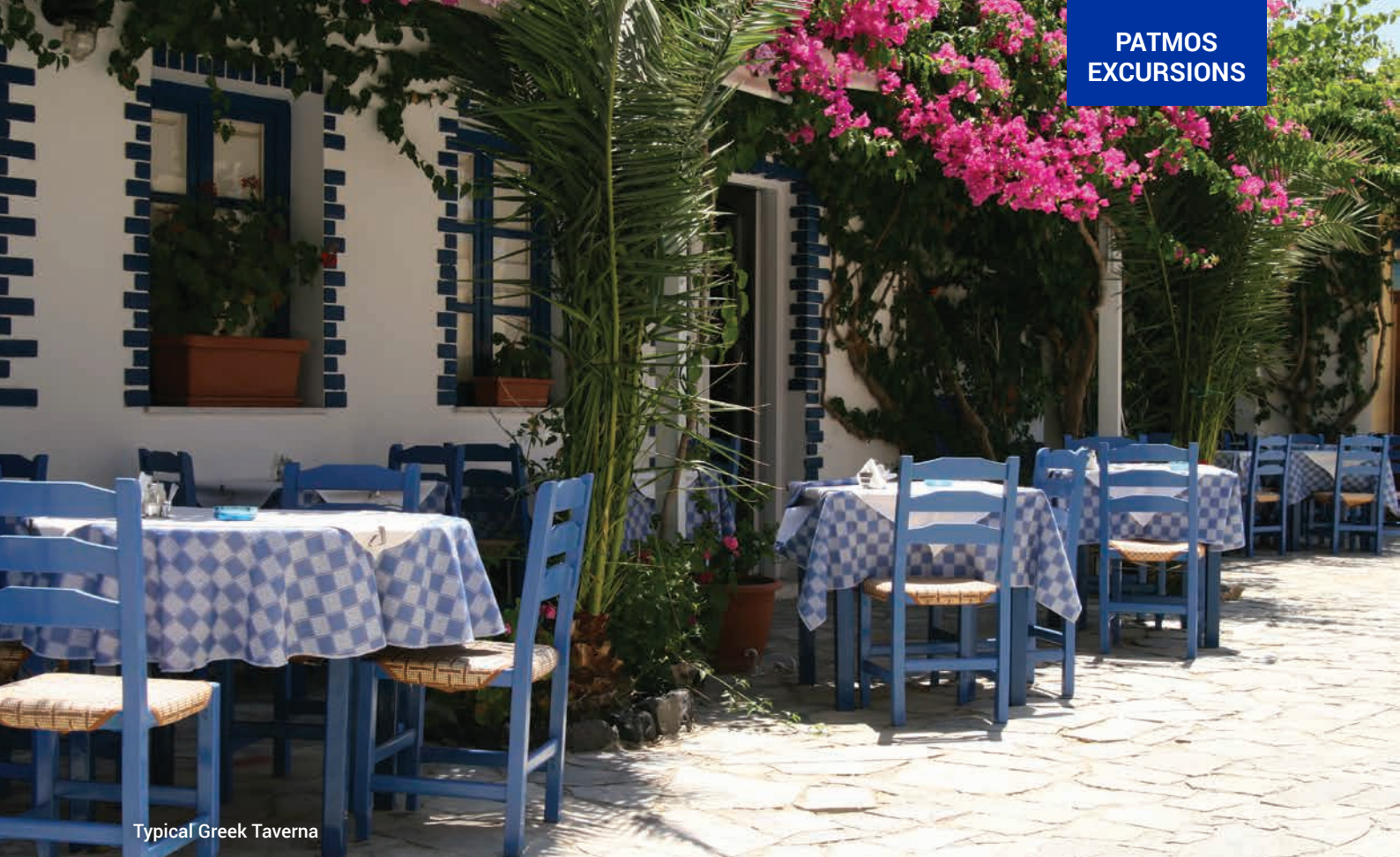
Typical Greek Taverna