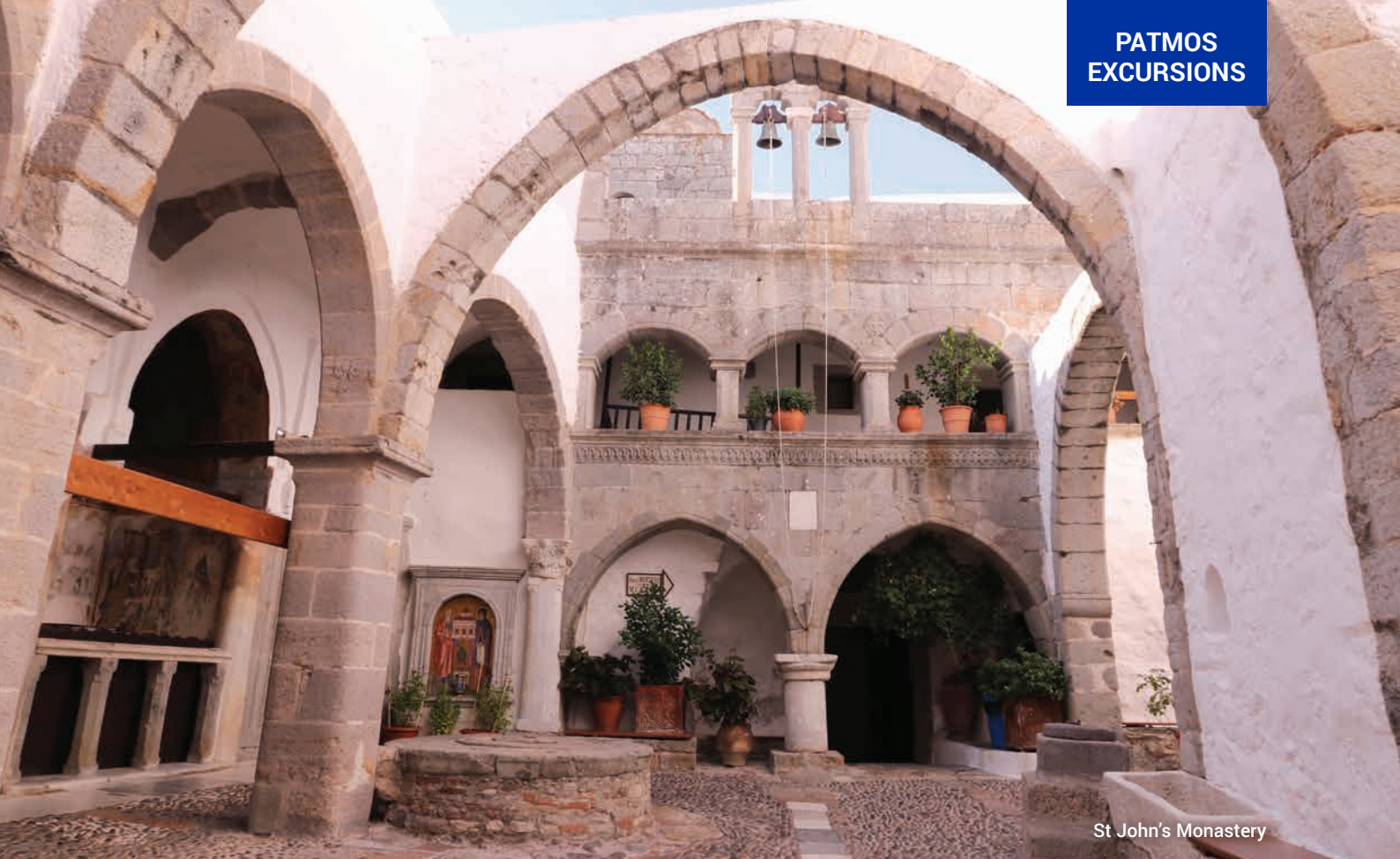
St John's Monastery