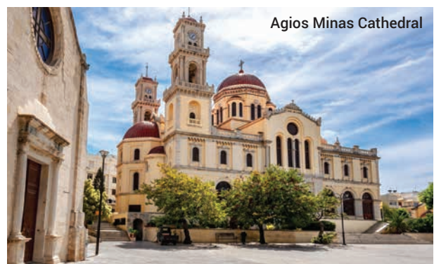
Agios Minas Cathedral