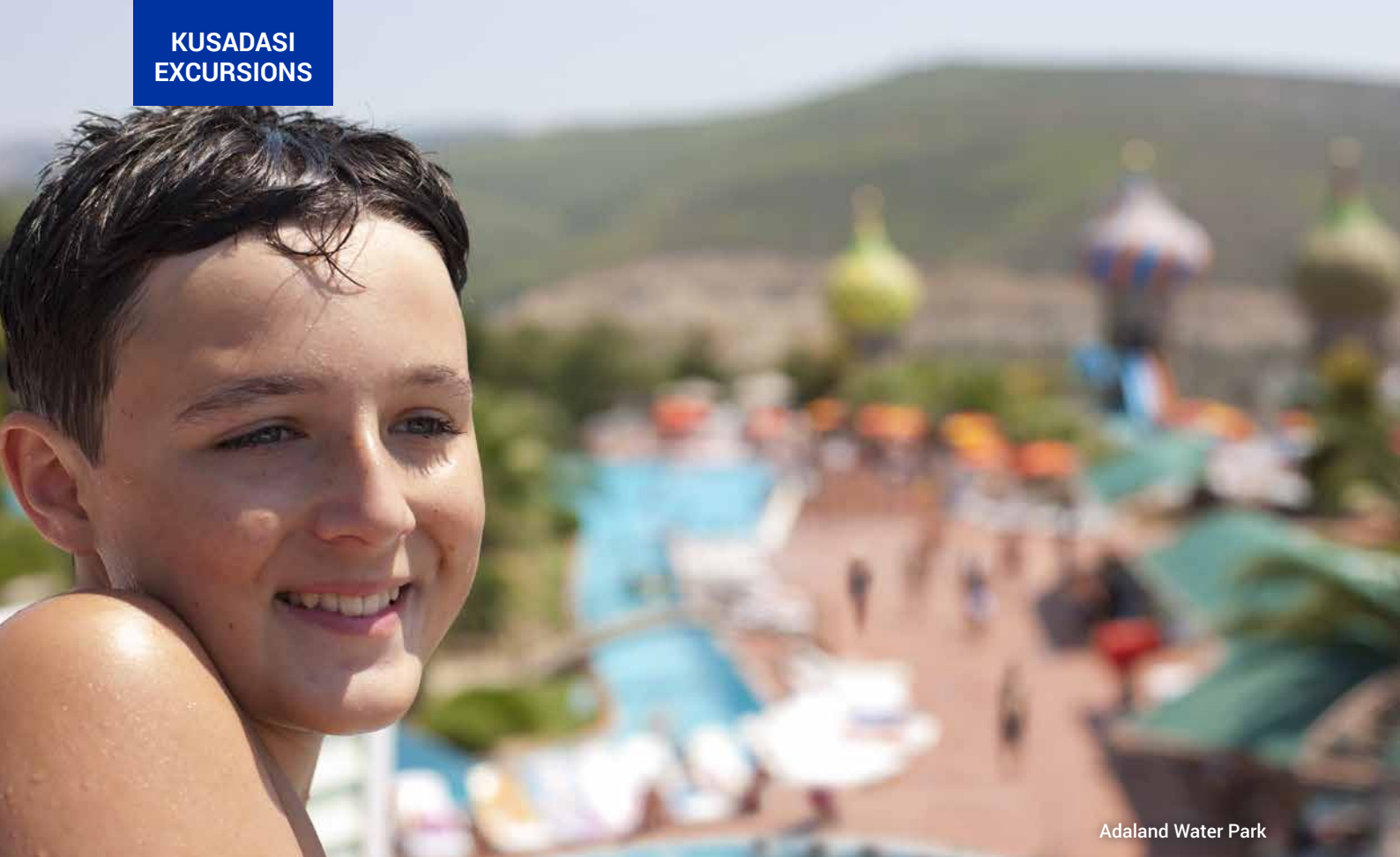
Adaland Water Park