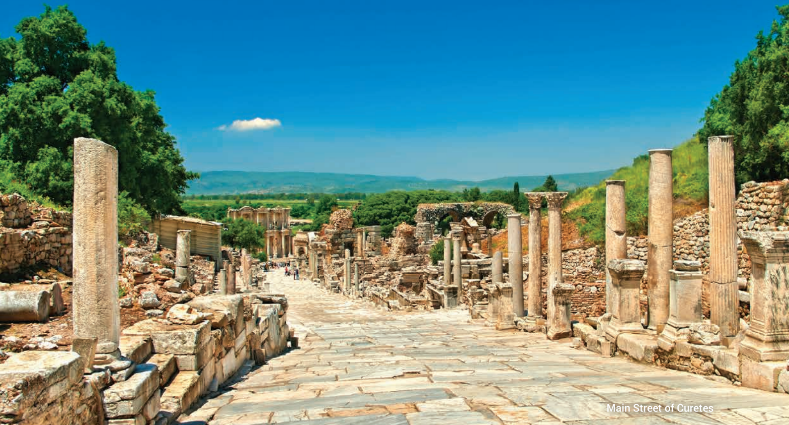
Main Street of Curetes