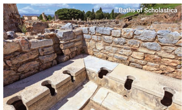
Baths of Scholastica