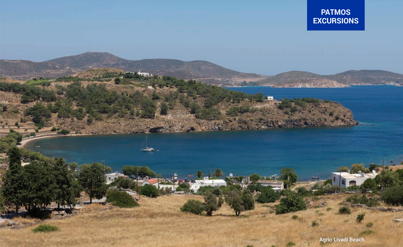
Agrio Livadi Beach