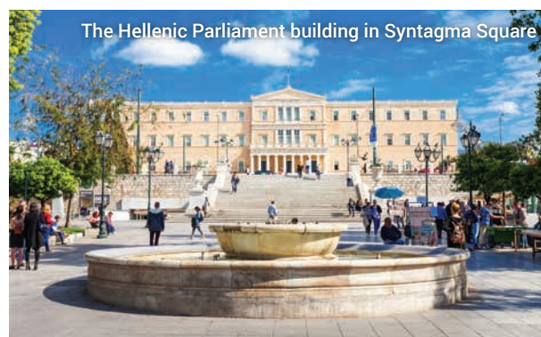
The Hellenic Parliament building in Syntagma Square

At the end of our journey we hope you will have a full appreciation of the glories of classical Athens and a sense of one of the most historically important capitals in the world.