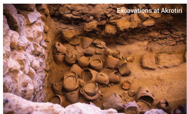
Excavations at Akrotiri

Tour may not be available at certain times of the year.