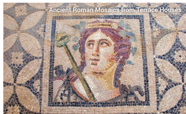
Ancient Roman Mosaics from Terrace Houses

We have time for shopping for carpets, jewellery, leather and other souvenirs at the end of our tour.