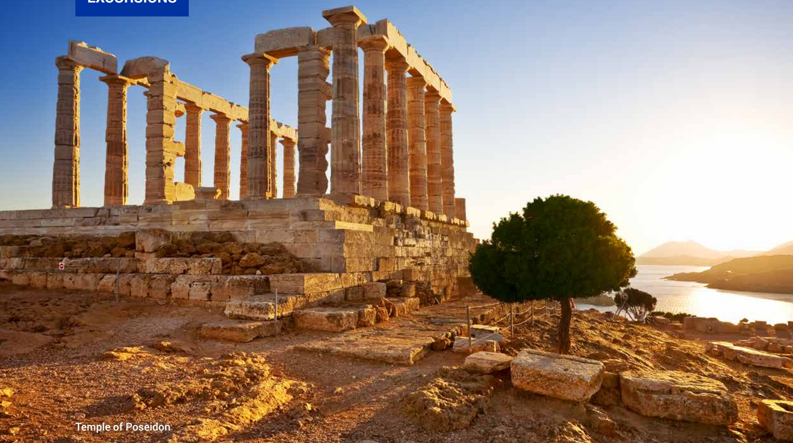
Temple of Poseidon