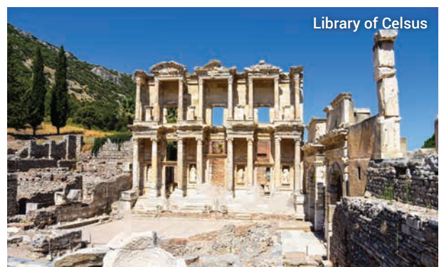
Library of Celsus