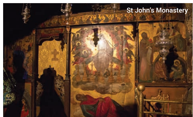
St John's Monastery

In Greek mythology Patmos originally existed at the bottom of the sea but Zeus was persuaded to allow it rise from the waters. The sun dried the land and people from the region began inhabiting the island they named Letois after the goddess Artemis.