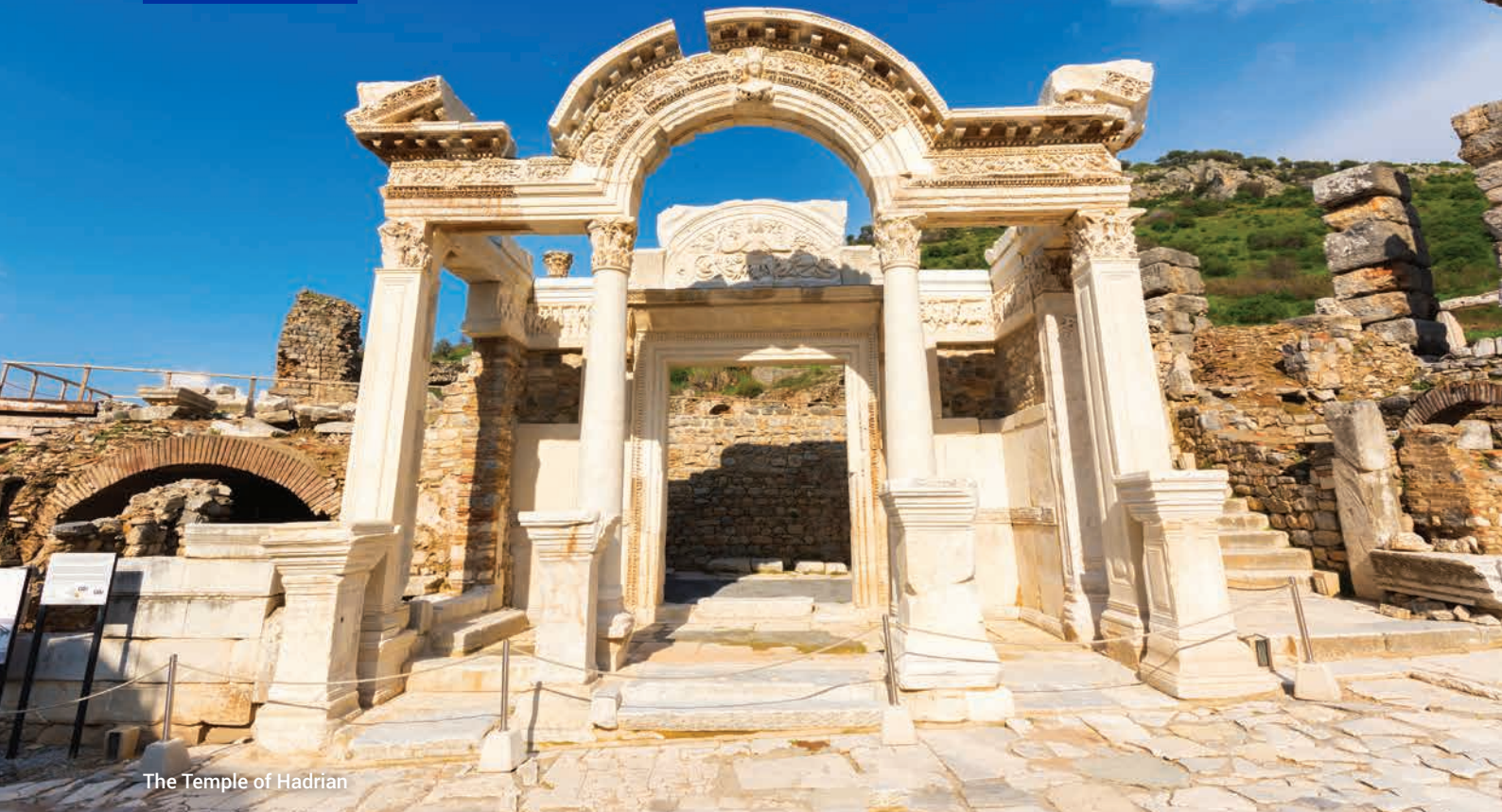
The Temple of Hadrian