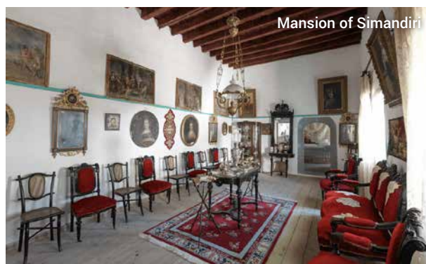
Mansion of Simandiri

Discover in the rooms antique furniture and silverware from 17th Century Russia, valuable artwork and icons from the 15th to 17th centuries. The mansion is veritable treasure trove and time machine which intrigues and fascinates.