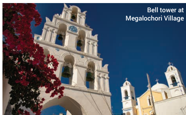
Bell tower at Megalochori Village