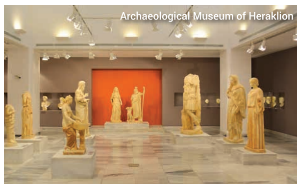
Archaeological Museum of Heraklion