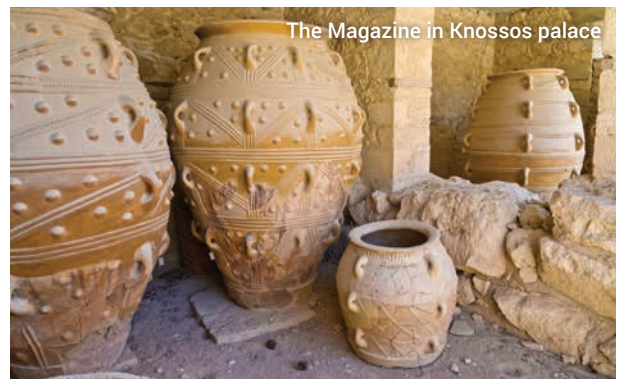
The Magazine in Knossos palace

Exploring from room to room we will relive time in the Hall of the Royal Guard and the King's Chamber, hearing about the extraordinary rule of King Minos.