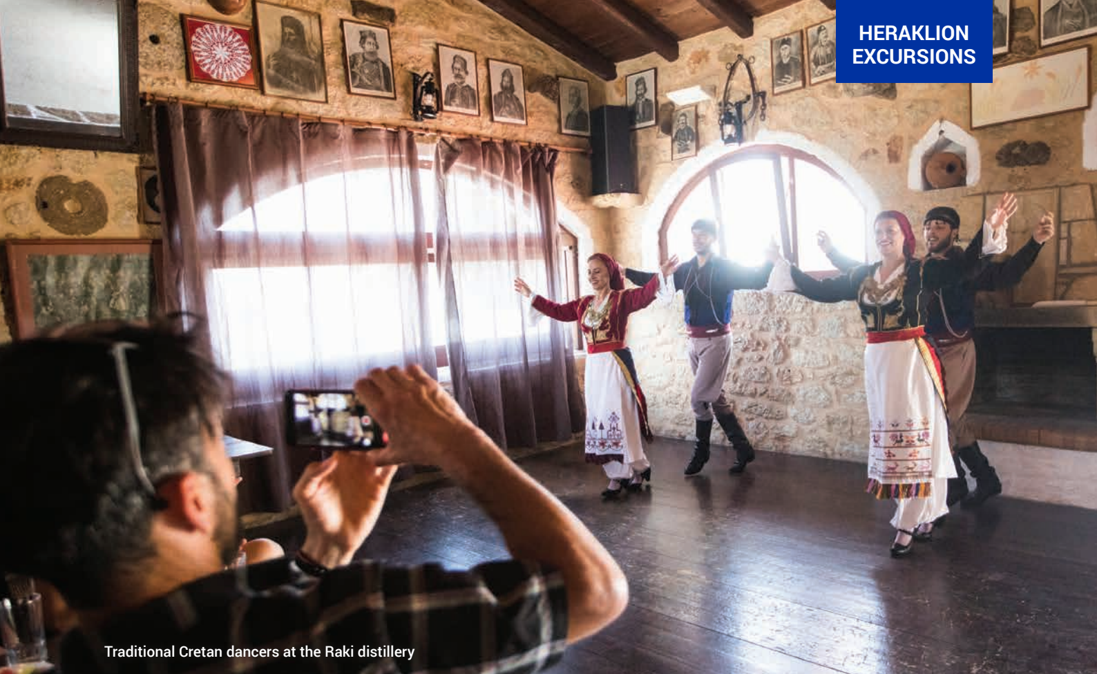
Traditional Cretan dancers at the Raki distillery