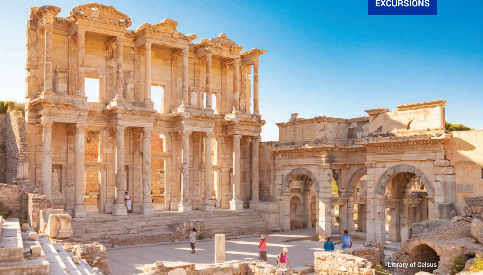
Library of Celsus